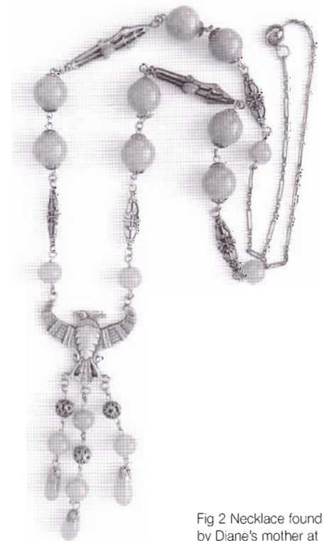
Fig 2 Necklace found by Diane's mother at