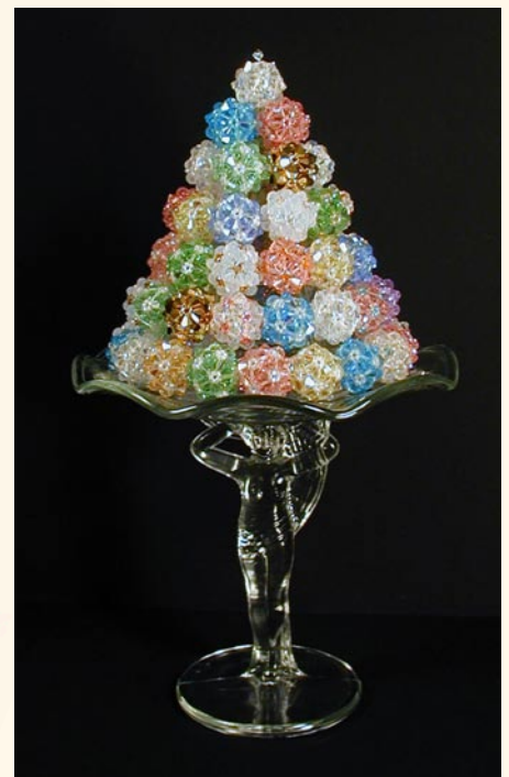
Below: Inspired by Ferrero Rocher chocolates and a picture in a 1950s Betty Crocker cookbook, Diane stitched Swarovski bicone crystals and Delica beads into 64 bite-sized Crystal Bonbons .