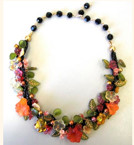
Right: Diane's Braided Garland Necklace unites vintage German glass flowers with contemporary resin flowers and leaves.