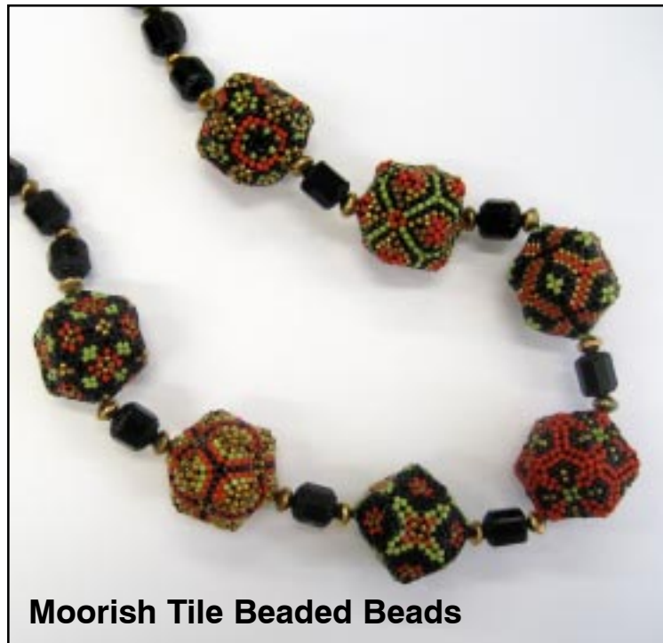
Moorish Tile Beaded Beads